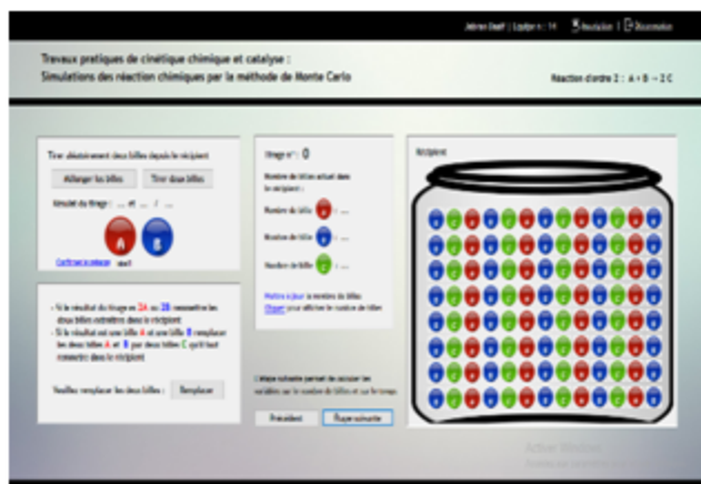
Figure 2. The Window that Presents the Container as Well as the Results of the Draws