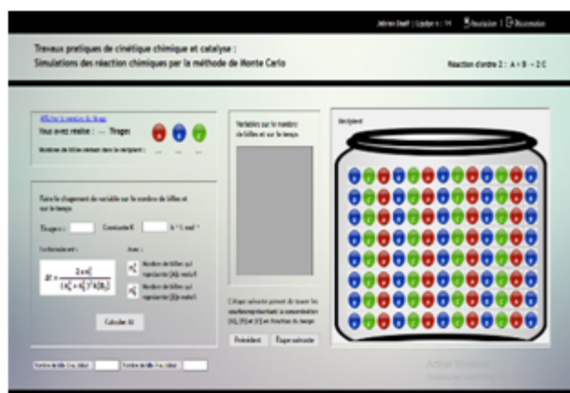
Figure 3. The Window with the Container, the Area to Calculate the Mathematical Formula and the results

architecture are the understanding of the system studied by defining its limits and managing its growth. It includes MVC architecture is to adopt more efficient architecture: