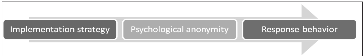
Figure 1. Impact in surveying system

The online surveying designer’s goal is how the questions are to be produced and in what format. Samples of the results and questions are also presented. Second input data and database files have to be designed to meet the requirements of the proposed output. The processing phases are handled through the online surveying tool Construction and Testing. Finally, details related to the justification of the system and an estimate of the impact of the system on the user and the organization are documented and evaluated by management as a step towards in implementation strategy and psychological anonymity and response behavior.