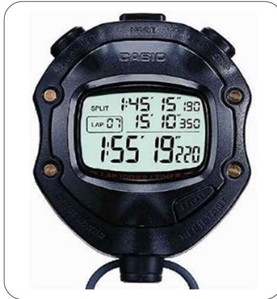
Figure 7. A Casio chronometer