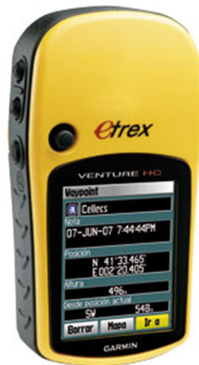
Figure 5. GPS, it was used to measure distances