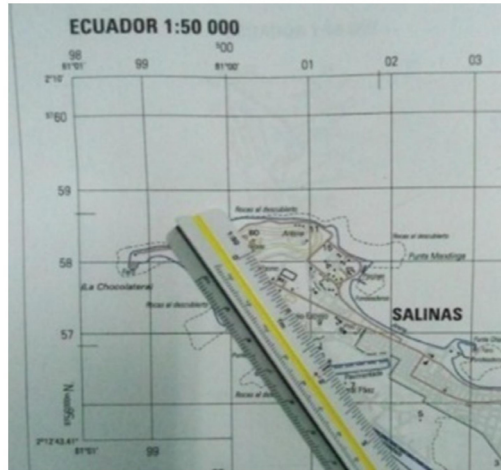
Figure 4. Topographic Map, which is used to measure distances through scales

The measuring instruments used for this study were: topographical map, chronometers (CASIO), GPS (GARMIN Etrex), meteorological measuring equipment (VAISALA), which are illustrated in Figure 4, Figure 5, Figure 6 and Figure 7.