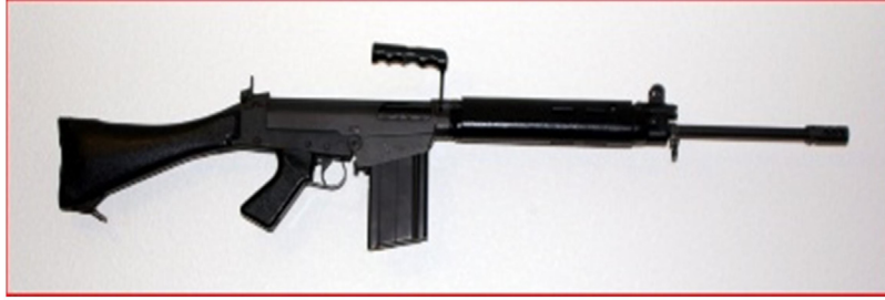
Figure 1. FAL Rifle used during military training

The FAL rifle is a Belgian battle weapon, it is chambered for the 7.62×51mm NATO cartridge. The word FAL comes from the French acronym “Fusil Automatique Leger” which is translated in English as Light Automatic Rifle [9]. It is illustrated in Figure 1, and it is used during the military training at the Air Force Academy.