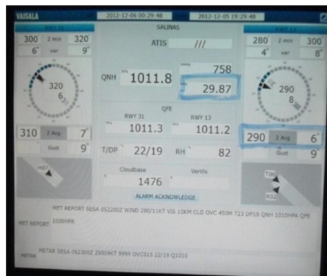
Figure 6. Instrument applied to determine meteorological conditions, in this case, the temperature