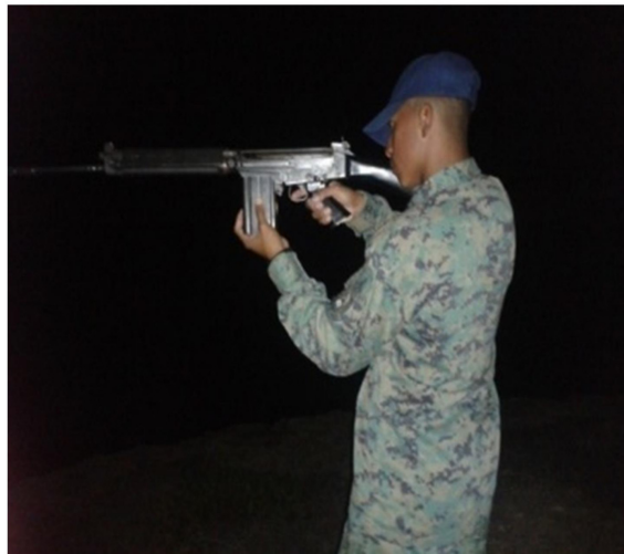
Figure 3. Each student had 8 attempts

This is a non-experimental cross-sectional research, the data were collected once, and the participants were 45 students and an expert rifle shooter. The objective of the experiment was to measure the time from the sparks ignition until the sound produced by the gunpowder explosion during each shot to calculate distances. This study took place in the province of Santa Elena, in the city of Salinas, at the Military Aviation School which is located in the parish of Chipipe. It was used a FAL rifle, which was chambered for the 7.62 × 51mm NATO cartridge, each student had 8 attempts at a temperature of 22° C at 7:30 in the evening, as it is illustrated in Figure 3.