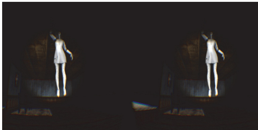
Figure 2. Sample screenshot from the game Ghost Hunt

VR Oculus Rift tech demo application Ghost Hunt is a first person survival horror video game[18]. Horror games are very popular on VR platforms, especially on desktop based VR. The game was developed using the Unity game engine with support for mouse, keyboard or controller. The atmosphere of the game is shown in Fig. 2. Ghost Hunt is developed for the purpose of this paper and research of VR application development. Regarding operating system and hardware configuration, Ghost Hunt was developed on Windows 8.1 Pro, Asus N53S Notebook with Intel Core i3- 2350M 2.30 GHz processor, 4GB RAM, and Nvidia GeForce 610 2GB graphic card. Experience with VR devices and software tools is not so much different if we compare with the standard game development. However, VR solutions require knowledge regarding product quality and user experience development.