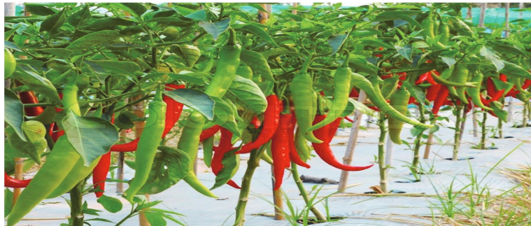
Figure 5. Healthy of plant Chilli

The imread function is read image from graphics file. The imresize function is to returns an image of the size specified by [m-rows n-cols]. Images are resized for easier image processing [5], [11] MALTAB and LABVIEW software are used for the simulation purpose, LABVIEW is an advance software [12] used for the simulation and GUI formation.