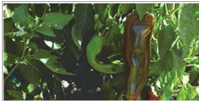
Figure 4. Diseased Image of Chili [13]

The original value of pixel is included in computation of the median. These filters are quite popular because certain type of random noise, they provide excellent noise reduction capabilities, with considerably less blurring than linear smoothing filter of similar size.