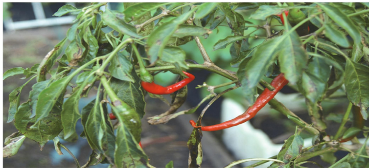
Figure 6. Diseases on Chilli plant