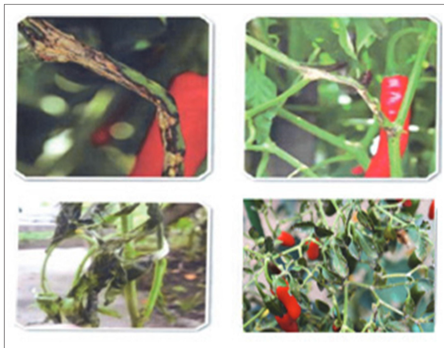
Figure 1. Samples of plant chilli disease

The remaining paper is organized as below. Section 2 describes the related work. Detail methodology along with all steps for implementation is elaborated in Section 3. An algorithm is presented in Section 4. Results are depicted in Section 5 and finally conclusions are drawn in Section 4.