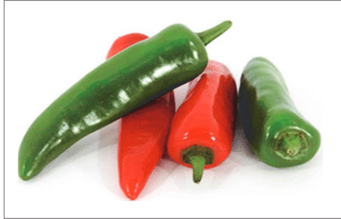
Figure 2. Healthy Image of Chilli [13]

An idea to overcome the problem of face images taken in different lighting condition by combining the robust illumination normalization, local binary pattern texture descriptor and principal component analysis is considered. Here an image is a known face image when Euclidean distance between a test image and training images is minimum. And if this distance is not attained, it is an unknown face image [9].