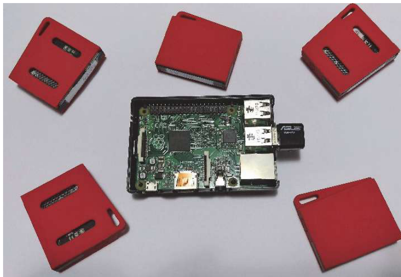
Figure 1. Raspberry Pi 2 with the SensorTag CC2650 nodes

For monitoring the air temperature has been used SensorTag CC 2650, show in Figure 1, and it will operate under the Bluetooth Low Energy mode that is the default firmware for the sensor nodes. This sensor node has ten low power consumption sensors: ambient light sensor, altimeter/pressure sensor, humidity sensor, 9 – axis motion sensor, IR thermophile temperature sensor, magnet sensor and microphone [2].