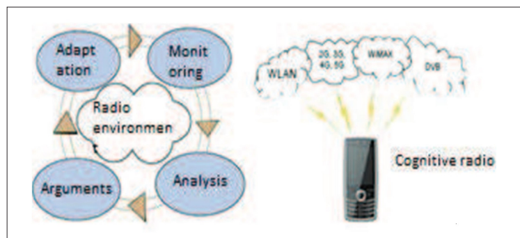
Figure 1. Cognitive cycle