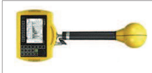
Figure 1. Selective Radiation Meter SRM 3000 Narda

For the purpose of the experiment, a simple communication system that simulates the operation of GSM communication was made. A signal generator MXG N5182B KEYSIGHT, which operates at frequencies from 9 kHz to 3 GHz, was used as the transmitter. The generator was set to a frequency of 1200 MHz, with GSM modulation. The output signal was set up to 20 dBm (0,1W), and was emitted by an antenna. The antenna was a Comet SMA-703 - three-band. The antenna bands are 144 MHz, 400 MHz and 1200 MHz, with a gain of 3.4 dBi at 1200 MHz. The measurements are carried out in the antenna far field. The receiver was implemented with USRP NI2920, connected to a PC via Gigabit Ethernet. The strength of the electromagnetic field at various distances from the generator was measured by Selective Radiation Meter SRM 3000 Narda, Figure 1, which works at frequencies 100 kHz to 3 GHz [11].