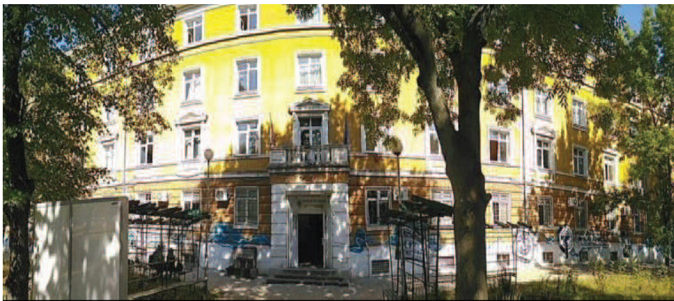
Figure 1. Photo picture of the building

The numerical simulation was made in a training corpus in the building of the Professional high school of Telecommunica