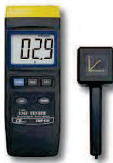
Figure 1. Measuring device Lutron EMF-828 with separate probe

Magnetic field measurement is performed by EMF measuring device Lutron EMF-828 with separate probe, including sensing head. Fig. 1 shows the measuring device Lutron EMF-828 with its probe.