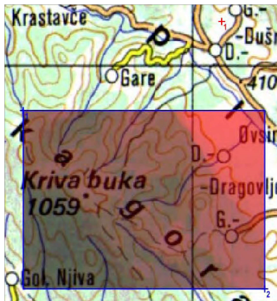
Figure 1. Visualization of the field strength intensity inside the rectangular area of interest

The component ReceiverLoactionAnalyser is devoted to find optimal location. The component provide support for the three types of receiver area: set of points, rectangular area and polygonal area. Two rectangular and polygonal areas are represented with the regular grid of cell of equal size. Size of the cell can be defined externally to accommodate user needs. The method calculates the field strength estimation for each point. The ReceiverAnalyser sort calculated values easily and extract arbitrary number of the optimal receiver location.