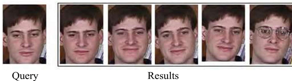
Figure 2. Example of given query image and the first five retrieved using SIFT