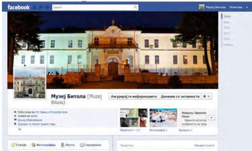
Figure 5. Facebook profile of the Bitola museum

The facebook profile of the Bitola museum was created the same time when the website was launched. At first it was used as a tool for boosting the website traffic, but the preliminary results uncovered its true potential.