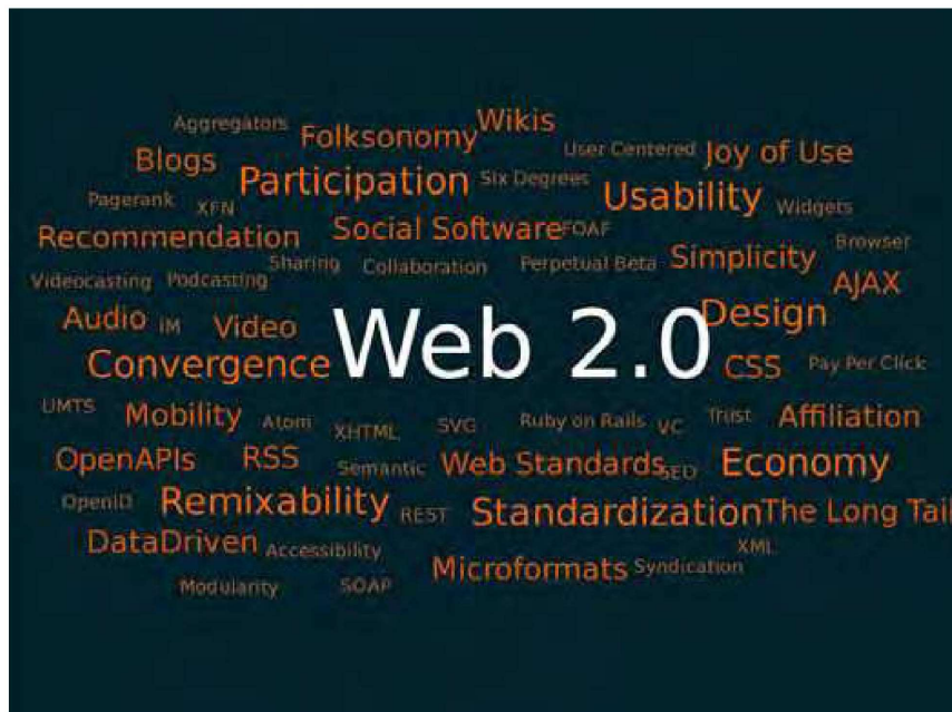
Figure 2. A tag cloud (a typical Web 2.0 phenomenon in itself) presenting Web 2.0 themes

According to ICOM , "Museum is non-profit, permanent institution in the service of society and its development, open to the public, which acquires, conserves, researches, communicates and exhibits the tangible and intangible heritage of humanity and its environment for the purposes of education, study and enjoyment". [1]