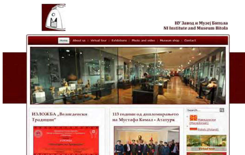
Figure 3. The web site of the Bitola museum ( www.bitolamuseum.org )

With the introduction of the new museum exhibit and the necessity of its adequate presentation, new strategy was developed, based on the proven virtual technologies, supported by the use of Web 2.0. The new website of the Bitola museum was presented at the beginning 2010.