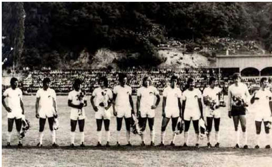
Figure 6. Donated photo from the online friends

Small test was conducted, where one photo gallery from the website was shared as external link, compared to the same photos from the gallery uploaded and shared as album on facebook. The first approach resulted in increased number of visits on the website but with no comments. The facebook album was consecutively shared, but also individual images were tagged