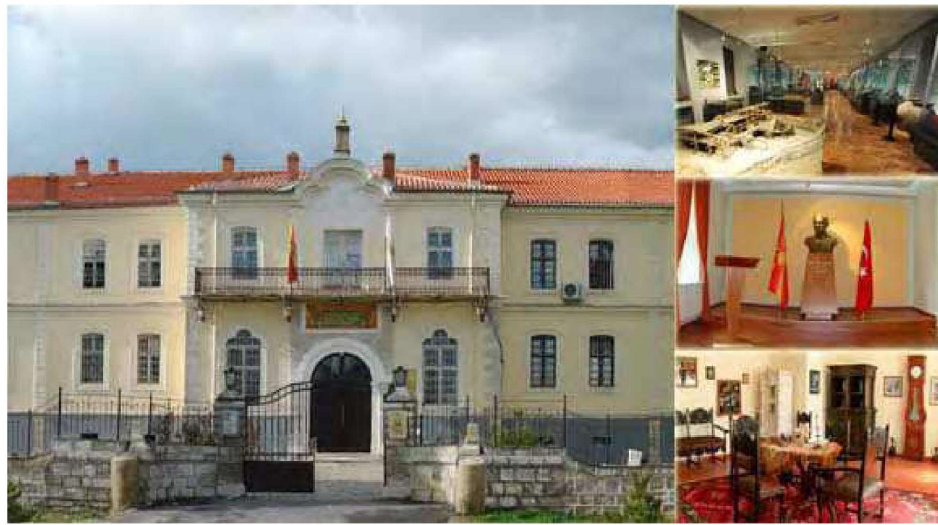
Figure 1. NI Institute and Museum Bitola

the curator's version of the story", which can be good or bad but never complete.