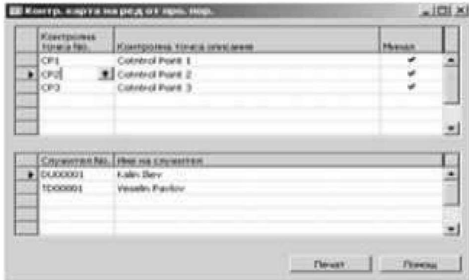
Figure 2. Production order control card

When an operation is completed the employee in charge sets the “Approved” flag for the corresponding control point and fills the list of employees who have performed the operations.