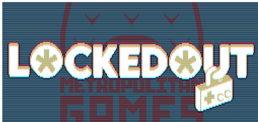
Figure 1. Current game title/logo design

Despite ongoing efforts, issues with password hygiene persist, highlighting the necessity for more effective ways to convey password security information to users.