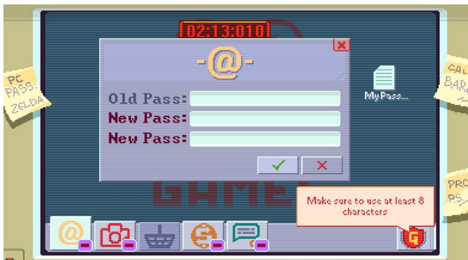
Figure 2. Password change UI

"Lockedout" is a 2D pixel art time challenge game designed to educate players about prevalent cybersecurity risks and underscore the critical importance of password strength. It embraces a pixelated aesthetic reminiscent of video games from the 1980s and 1990s, deliberately chosen to infuse a sense of charm and playfulness into the overall gaming experience. The game's title (Figure 1.), "Lockedout," is a wordplay carefully selected to convey the concept of being virtually locked out due to password-related issues.