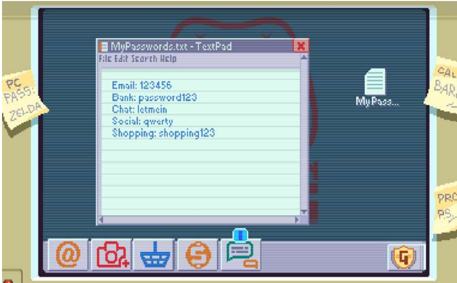
Figure 5. MyPasswords.txt document preview