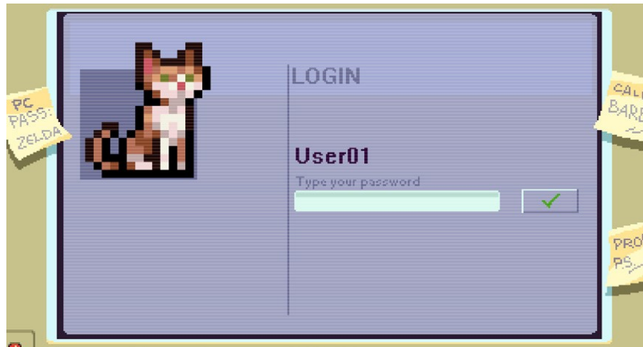
Figure 3. OS Login screen

An imaginary hacker or hacker group will also be featured in the narrative; however, they will not be directly portrayed within the game.