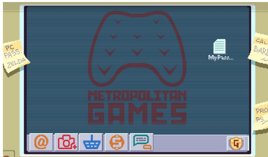
Figure 4. Desktop