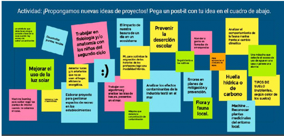
Figure 2. Brainstorming on Machine Learning in Science Education (Spanish version)

At the end of the experience, teachers share ideas for school scientific projects that integrate Machine Learning and Artificial Intelligence into the curriculum to support teaching, as shown in Figure 2.