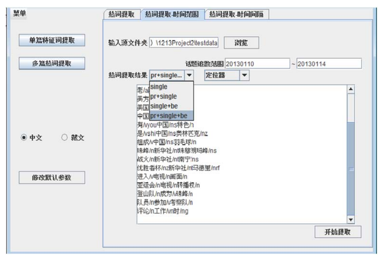
Figure 5. Hot topics of the "pre + single + be" option (Designed in Chinese)