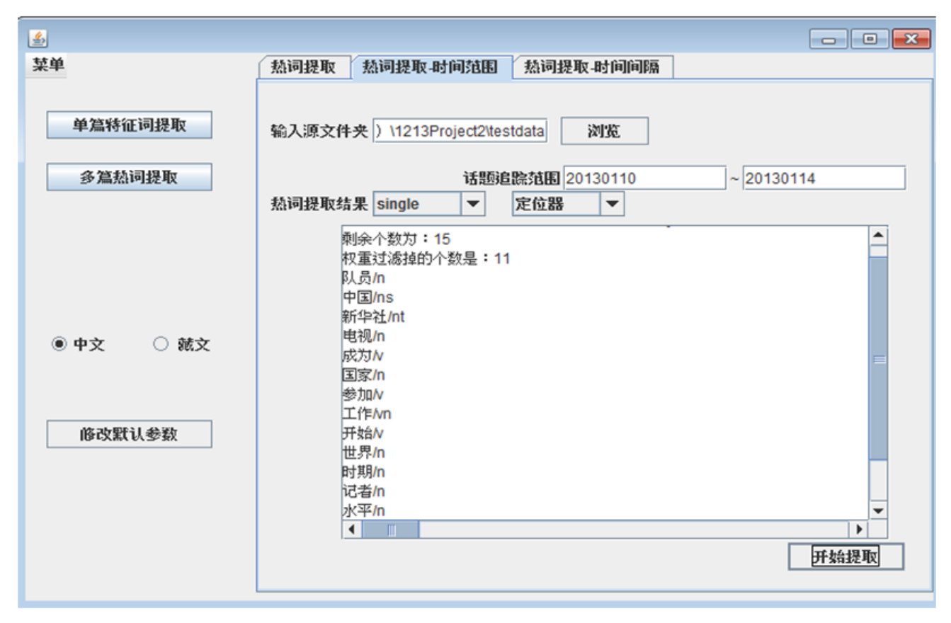
Figure 3. Hot topic word extraction from the XML file set based on the date scope (Designed in Chinese)